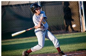
Sports Camps & Clinics