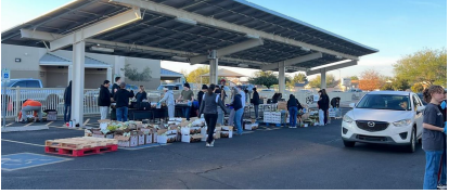
DHS JROTC cadets helping in the Farm2table event in Riverview Elementary